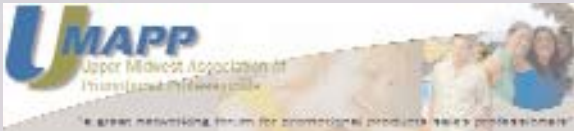
Website Home Page Advertising